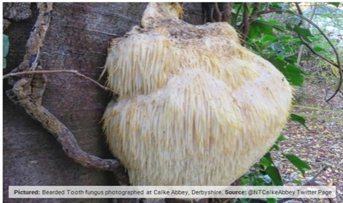
Pictured: Bearded Tooth fungus photographed at Calke Abbey, Derbyshire.