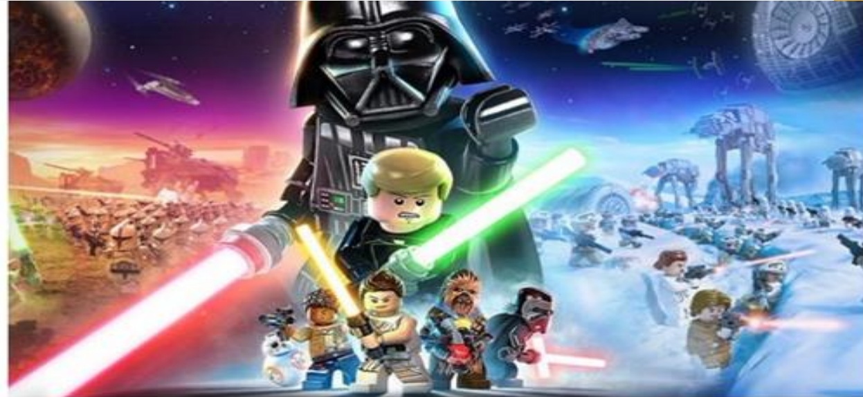
Pictured: LEGO Star Wars Game - The Skywalker Saga.