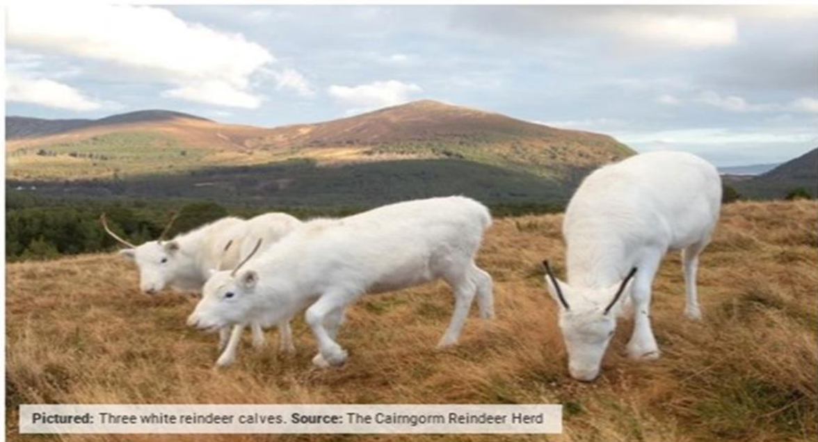
Pictured: Three white reindeer calves.