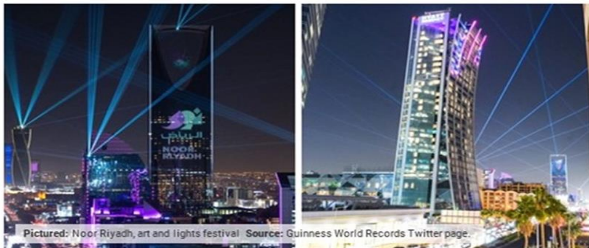
Pictured: Noor Riyadh, art and lights festival

Noor Riyadh 2022 (Noor means light in Arabic), an art festival held in the Saudi Arabian capital city, has broken six world records! The massive celebration of light art, now in its second year, has tripled in size from the previous year. This year, it attracted 1.5 million visitors to more than 40 locations across the city that were showcasing the work of over 130 artists. Take a look at the Guinness world records that this spectacular festival now holds;